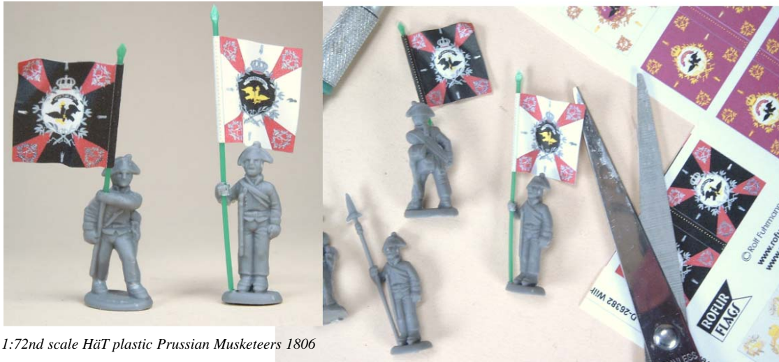
1:72nd scale Hät plastic Prussian Musketeers 1806