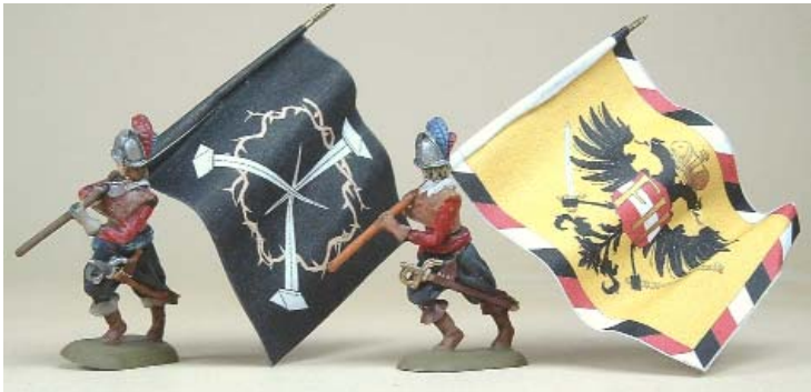
30 Years War Flags with Revell plastic Figures