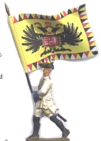
Right: Seven Years War: Austrian Ordnance flag with REVELL 1:72nd scale plastic figure

Infantry: 1756-1781. 1 white flag and 3 ordnance flags / Cavalry: 1 white flag and 3 ordnance flags.