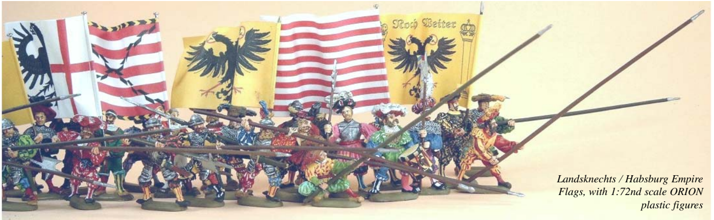
Landsknechts / Habsburg Empire Flags, with 1:72nd scale ORION plastic figures