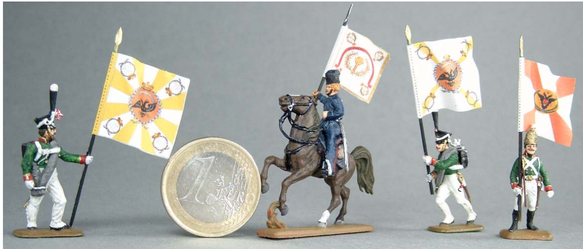
Russian flags of Napoleonic Wars with 1:72nd scale ZVEZDA plastic figures and - far right - 1 ITALERI grenadier flagbearer figure.