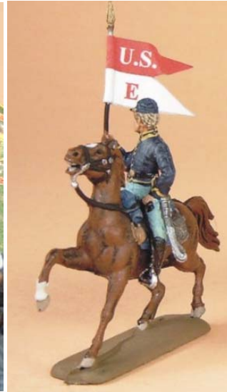
Left: US Civil War Flags of the Irish Brigade with 1:72nd scale plastic figures (IMEX and ITALERI).